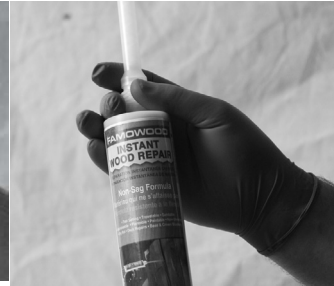
#3 Hold cartridge upright and screw on mix tube.