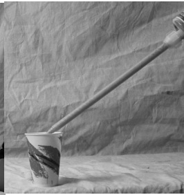
#6 Discard first 4-5 inches.