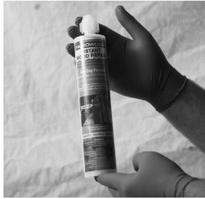
#1 Hold cartridge upright.