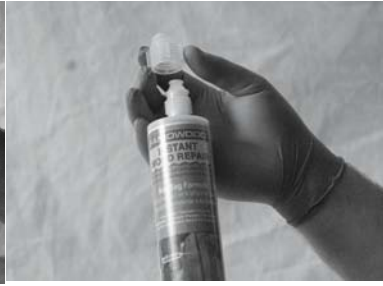
#2 Unscrew retaining nut and remove plug.